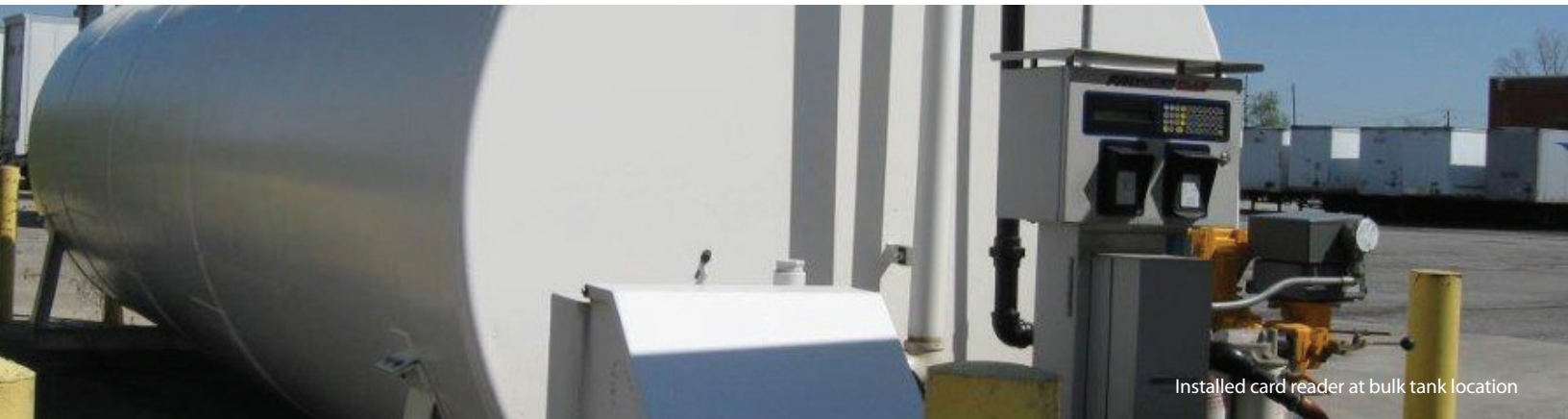
Installed card reader at bulk tank location